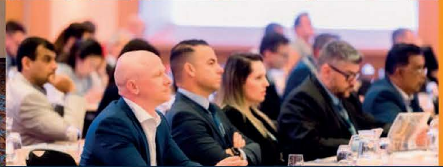
Logline's participation in the main international market events.